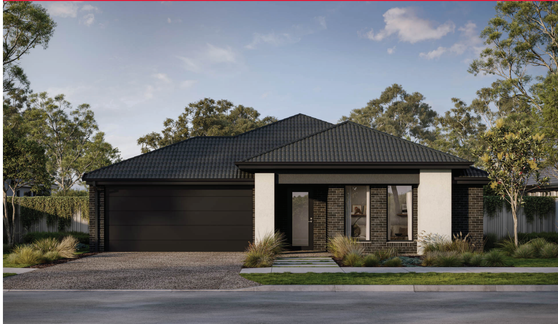
HARDY 25 | ELEVATE RANGE